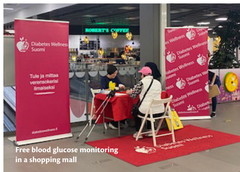
Free blood glucose monitoring in a shopping mall