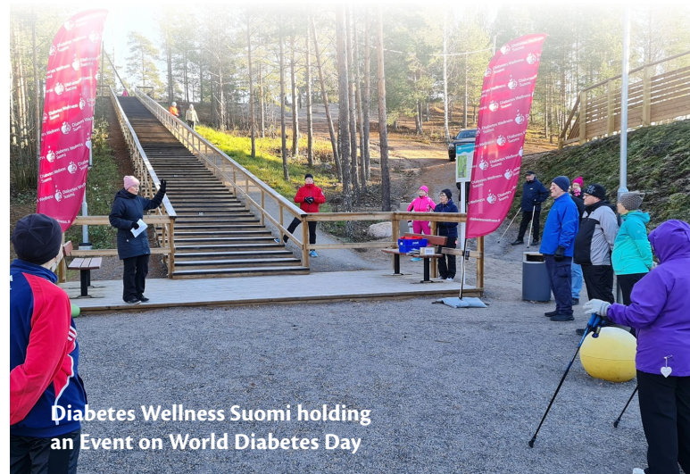
Diabetes Wellness Suomi holding an Event on World Diabetes Day